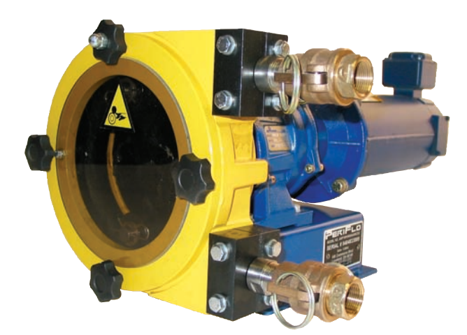
Our peristaltic hose pumps enable very precise metering. The reversing feature provides an easy means of flushing the pigment lines when system is being shut down for an extended period.