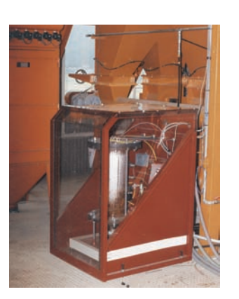
The standard E•Z Blend Slurry Dispensing System is used worldwide, including this installed unit in Japan.

The IndusTec Automatic Blending System. This system is capable of producing blends of 300 gallons or more. These blends may then be packaged for retail sale using one of our container fillers or may be used in a manufacturing process.